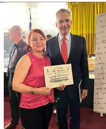
Με τον καθηγητή του Παντείου Πανεπιστημίου και υφυπουργό Παιδείας κκ Άγγελο Συρίγο

The awards were given solely based on its health protection content of the European Health Claim Regulation and the standard producers were awarded for their care for the production and promotion of olive oil as a product for the protection of human health. More than 1.050 producers participated in the tender process with olive oil samples from 10 countries.